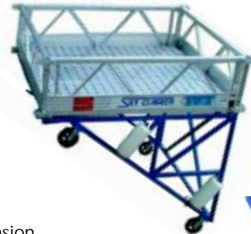
SSU Dance Floor