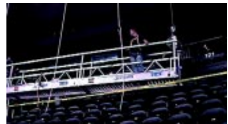
Moveable Stirrup, Adjustable Corner 1, 2, & 3 Meter Work Cages