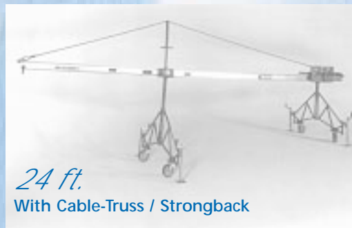
24 ft. With Cable-Truss / Strongback