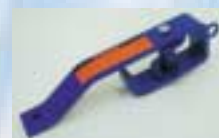
Ring Girder Roller